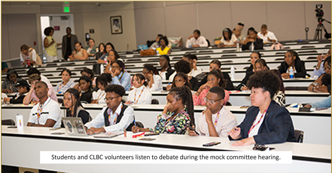
Students and CLBC volunteers listen to debate during the mock committee hearing.