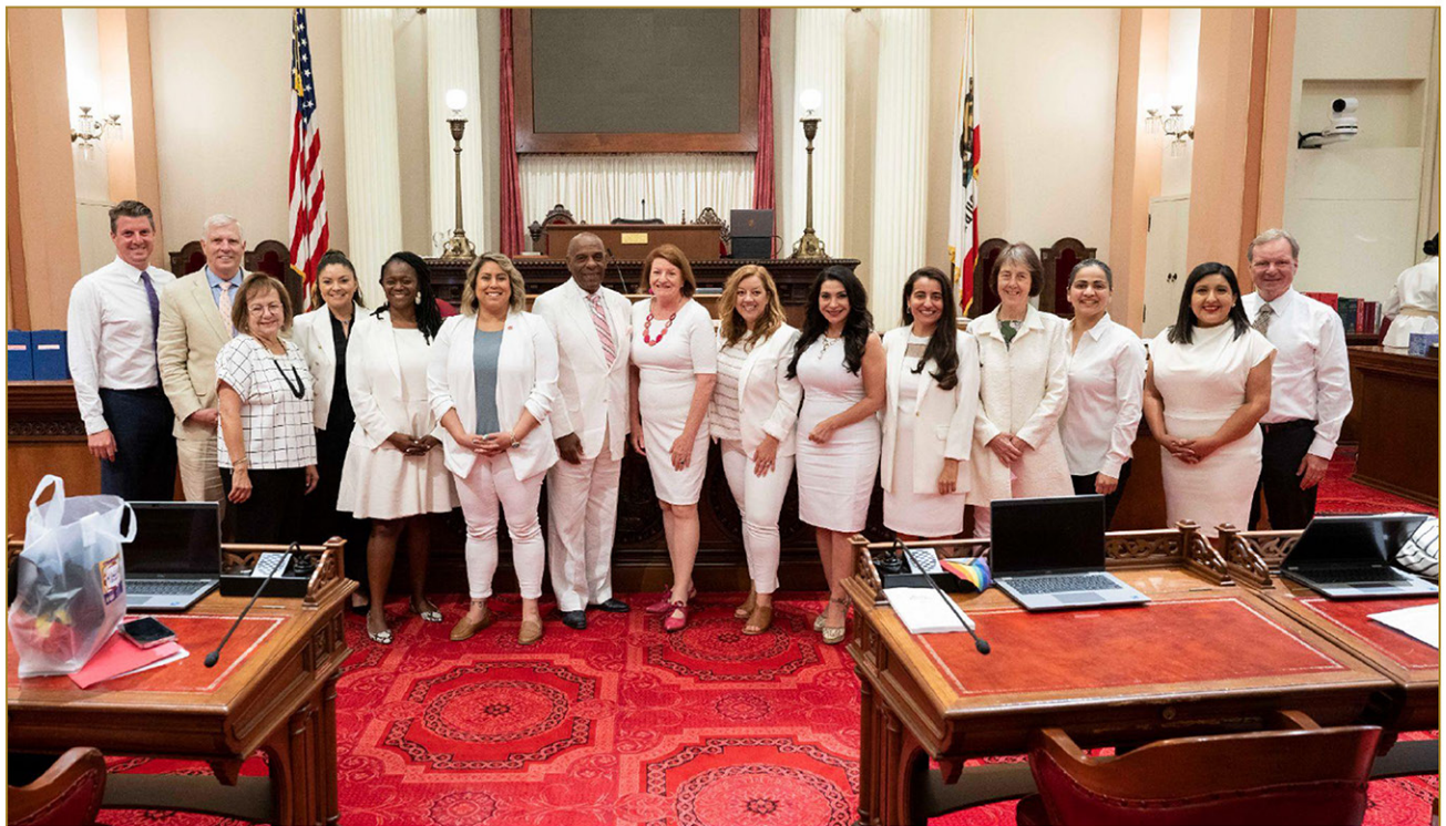
Members of the Senate join Black Caucus Vice Chair Bradford in solidarity for “White Suit Day”