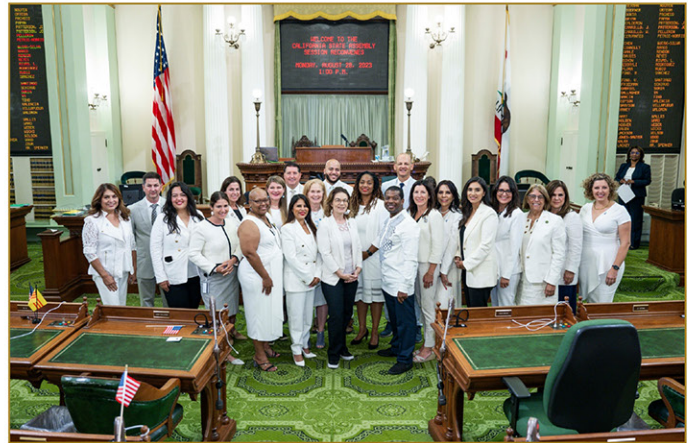
Assemblymembers join Black Caucus Members for photo in solidarity for “White Suit Day”