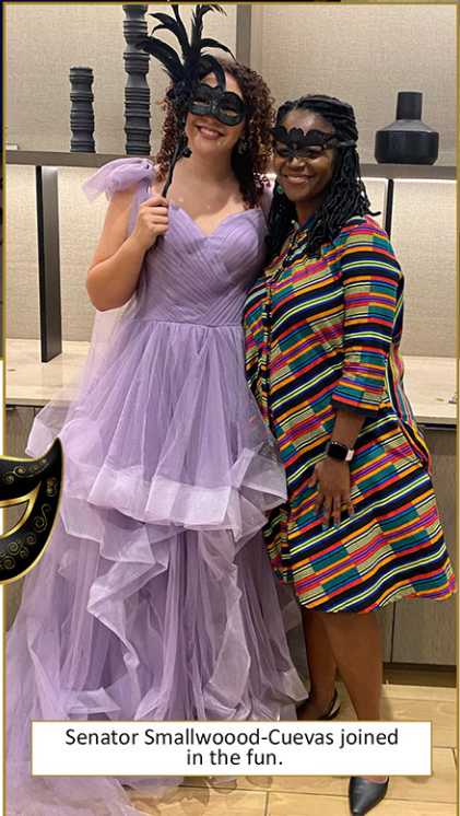
Senator Smallwood-Cuevas joined in the fun.